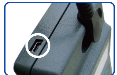
INPUT TERMINAL FOR USB