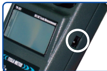
INPUT TERMINAL FOR AC POWER SUPPLY